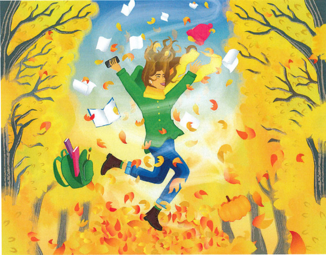
'Falling in love with fall', 24" x 18", $50 (Poster)